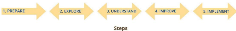
Figure 3. Service Design Process illustration (Värmland County Administrative Board, 2018)